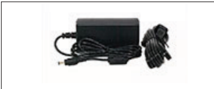
Power Supply (005755) - 100-240V power supply for the Z2.

Please note, these Accessories can be used with either the Z2 or the Z1® CPAP from Breas Medical. For more information visit www.breas.us .