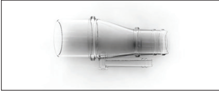
Tube Adapter (005779) - Required for Z2 operation. Adapts a standard 22mm CPAP hose to the outlet of the Z2.