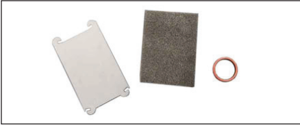
Qtube® Replacement Kits (006005) - Contains the replacement foam, O ring, and plastic wrap for the original Qtube Muffler.