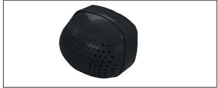
Plastic End Cap (007098) - Replacement end cap fits the Z2.