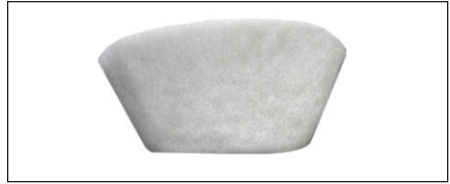
Filters (2 pack) (005788) - Replacement polyester air inlet filters for the Z2.